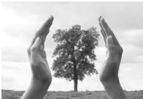
Our roots run deep